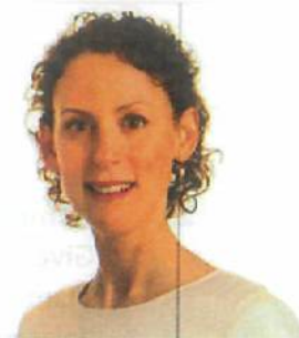
SENATOR MARIE SHERLOCK